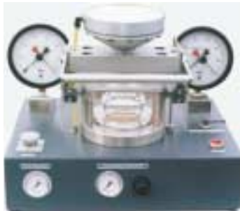
13-12-00 dual gauge