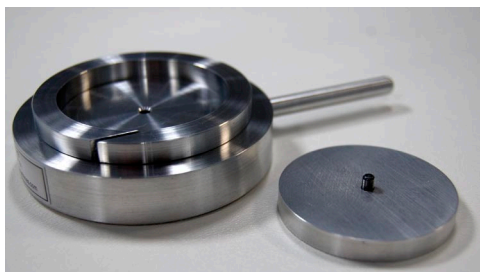
▲ RCT- Ring Crush holder with disks 17-11-13