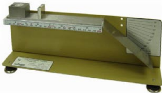
Fabric Stiffness Tester - Model 112