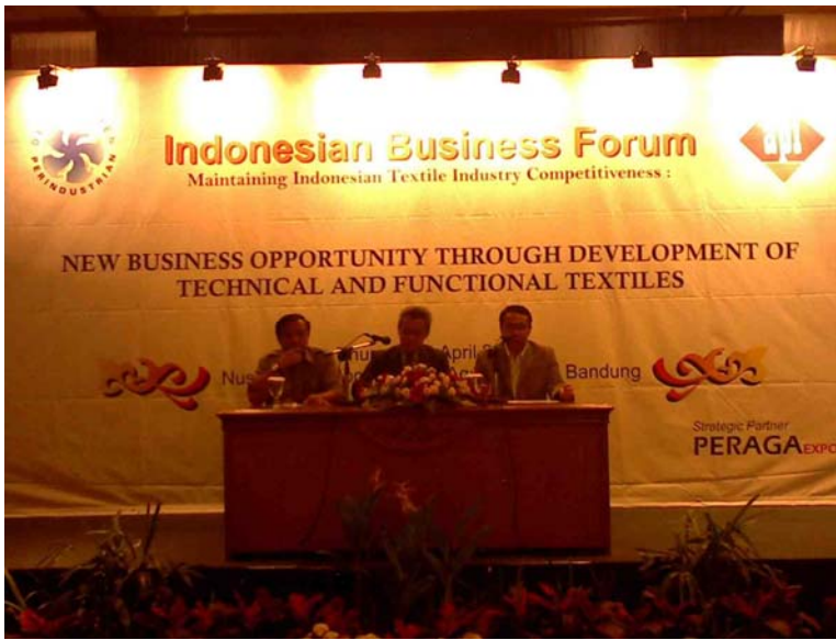
Seminar sponsored by Bandung Intertex 2008